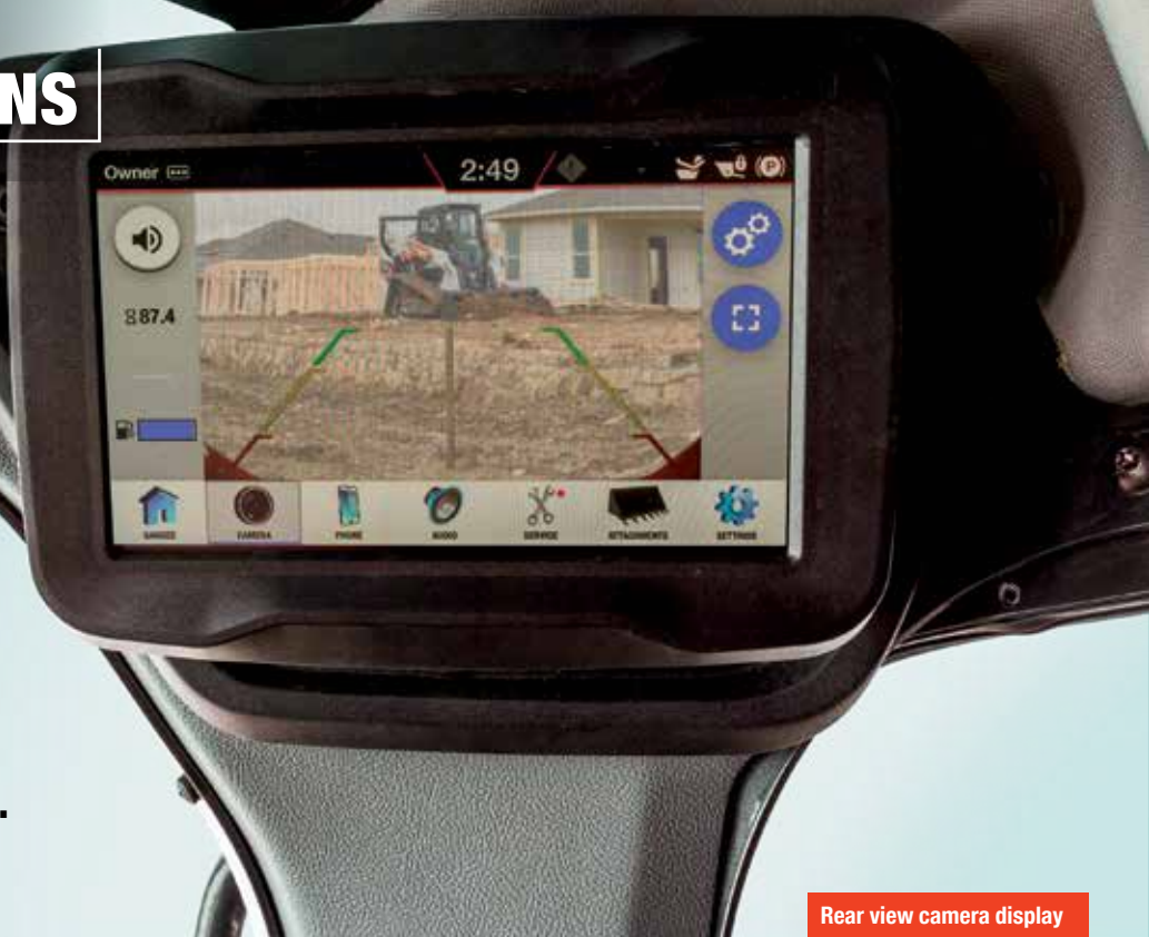
Rear view camera display

New Bobcat display options for R-Series loaders make it easier than ever to change settings, monitor your machine and match performance to the job.