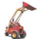
Compact Wheel Loaders